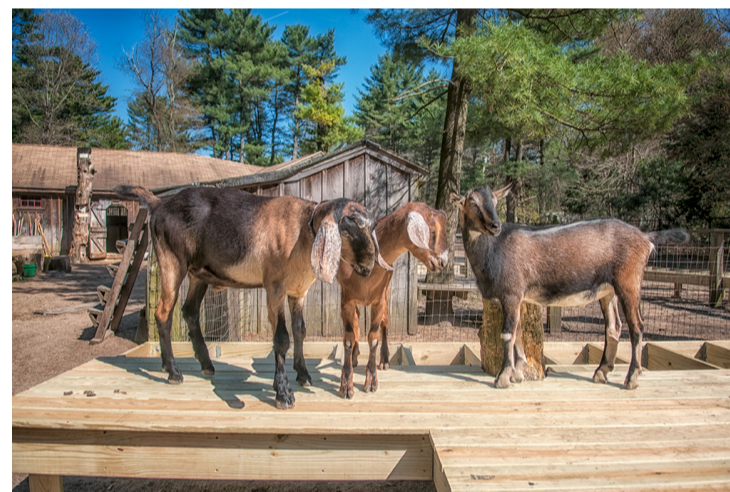
Milton with Rango and Levi