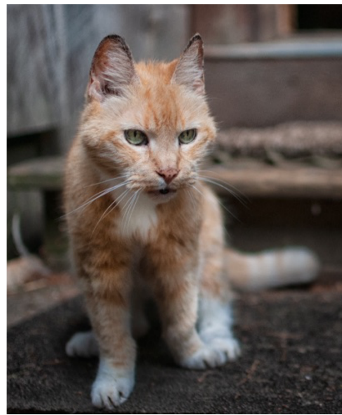
17-year-old Sunny is Mrs. Turtles' best friend; these senior gal pals spend a lot of time together.

It has been seventeen years since Mrs. Turtles became a three-legged cat. I remember vividly, being in the veterinarian's office, listening to the doctor say, "If it were me, I would put her down given her prognosis." The doctor determined she had two broken legs after being hit by a car, as well as severe nerve damage and fractured legs. Just by chance, another doctor peeked in and said there would be a small chance her nerves would heal and she may regain use of her legs.