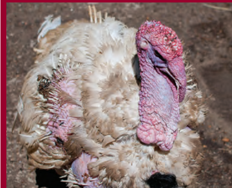
Isabella when she arrived.