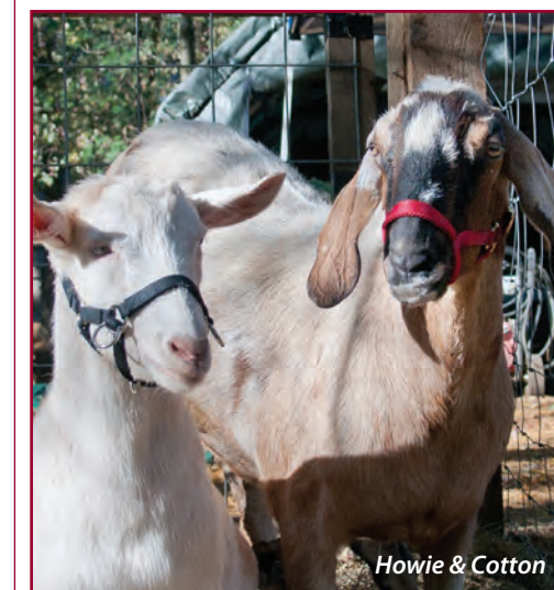
Howie & Cotton