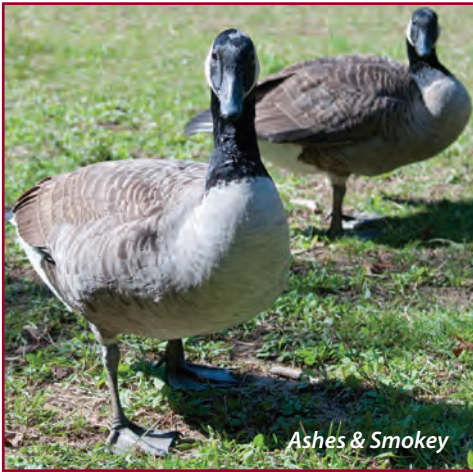
Ashes & Smokey

ASHES & SMOKEY are both young Canada geese, who apparently were abandoned by their geese family. Ashes has a damaged wing and can never fly. It's unclear why Smokey was left behind. Ashes loves hanging out and following the volunteers while they are doing their chores.