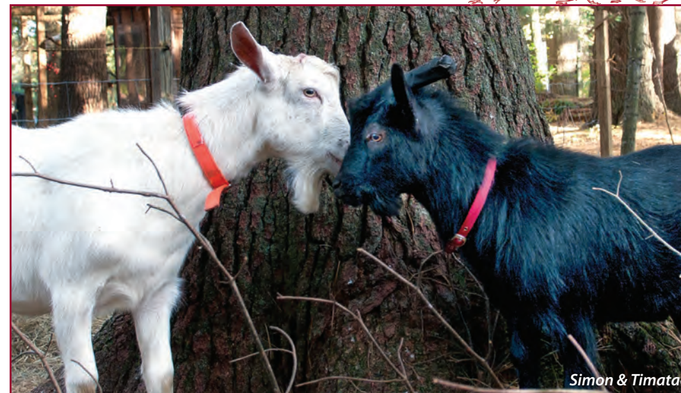
Simon & Timatao

TIMATAO & SIMON are the newest additions to the farm. Timatao is a cute three month old black goat. Originally rescued from slaughter, his new caretaker could not take of him, so he found a new home at Winslow Farm. The same day Simon arrived, as well. He was found tethered to a short leash on someone's property. Feeling badly for the four month old goat, some farm volunteers offered to pay the owner for the goat, along with a couple of hens. Thankfully, they were taken up on the offer and Simon was saved from slaughter. Timatao and Simon now have a huge area to play in.