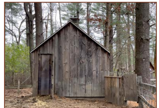
Homey's barn area

The stone barn, between the rooftop and the top of the walls, needed to be insulated. Oat straw was used instead of a fiberglass insulation. Again, the goal is to keep the farm green leaving as little of a carbon footprint as possible.