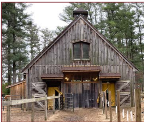
Moonie's Barn Front and Back

Moonie's barn (in memory of our blind horse, Moonie) was newly built this summer to provide more space to store hay and grain for our horses, pigs, donkeys and alpacas. Also, we rearranged the staircase and provided a new handrail leading up to the loft of barn from our new grain room.