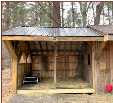
12x16 Alpaca Addition

On the backside of the barn three roof overhangs were built to shed the snow and rain from the horses stalls.