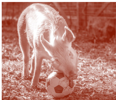
Willow Mia our Yorkshire nearly one year old pig.

Along Interstate 495 in Bolton, MA, a piglet was seen grazing along side the highway. She was rescued by police and the Animal Rescue