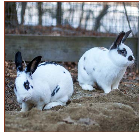
Cookie & Bugsy