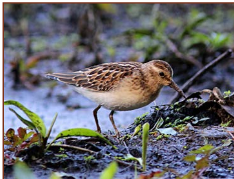
of a least sandpiper

Daffodil, Waterford, Halo, and Cotton, Maple, and Walnut