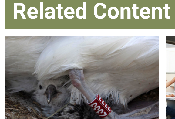
Good News Headlines 3/11/2021