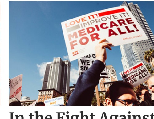
In the Fight Against Poor Health, the USA Is Punching Well Below Its Weight