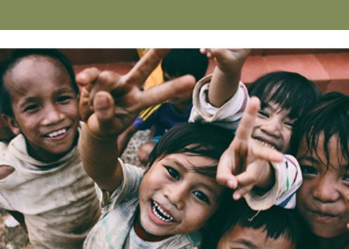
Economics As If Future Generations